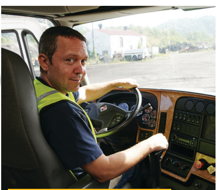
For more information: www.dec.edu/hecs