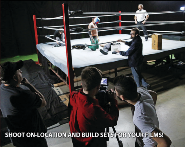
SHOOT ON-LOCATION AND BUILD SETS FOR YOUR FILMS!