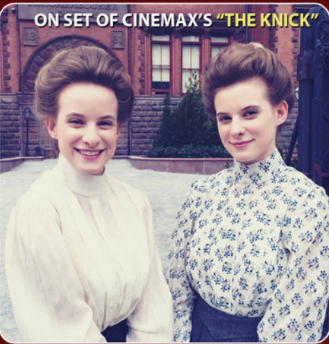
ON SET OF CINEMAX'S "THE KNICK"