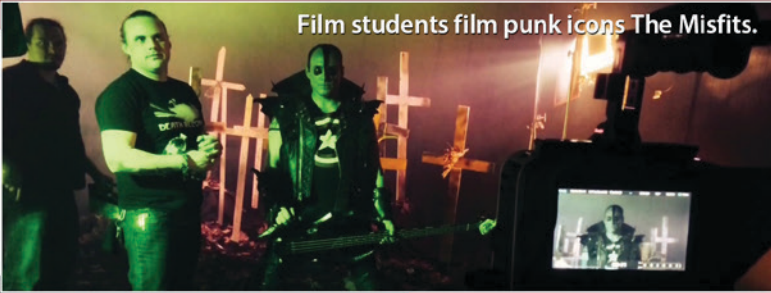
Film students film punk icons The Misfits.